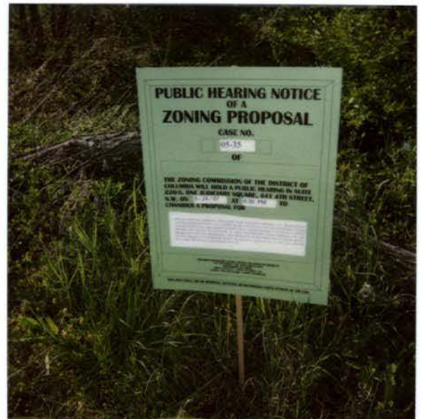
4 ELVANS RD, SE 4-10-07