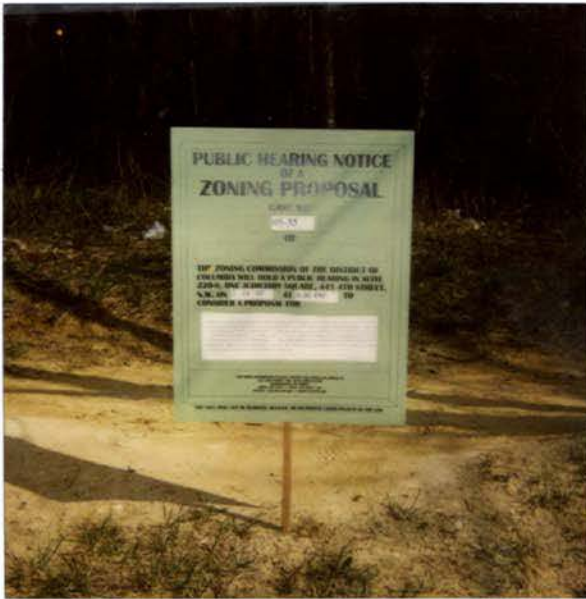
1 POMEROY RD, SE 4-10-07