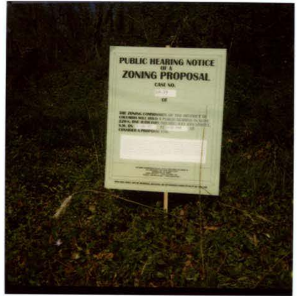
2 STANTON RD, SE 4-10-07